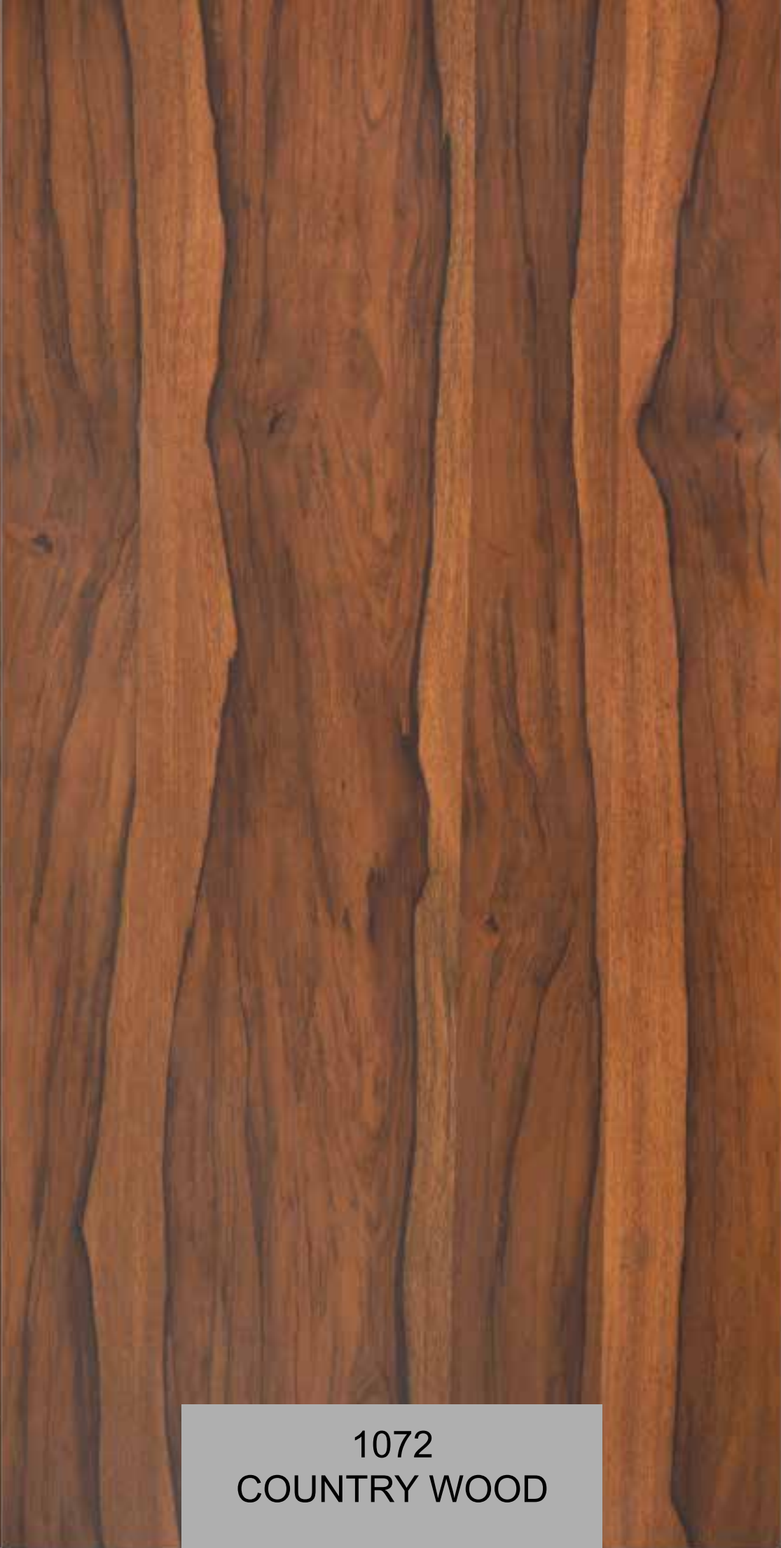
1072 COUNTRY WOOD