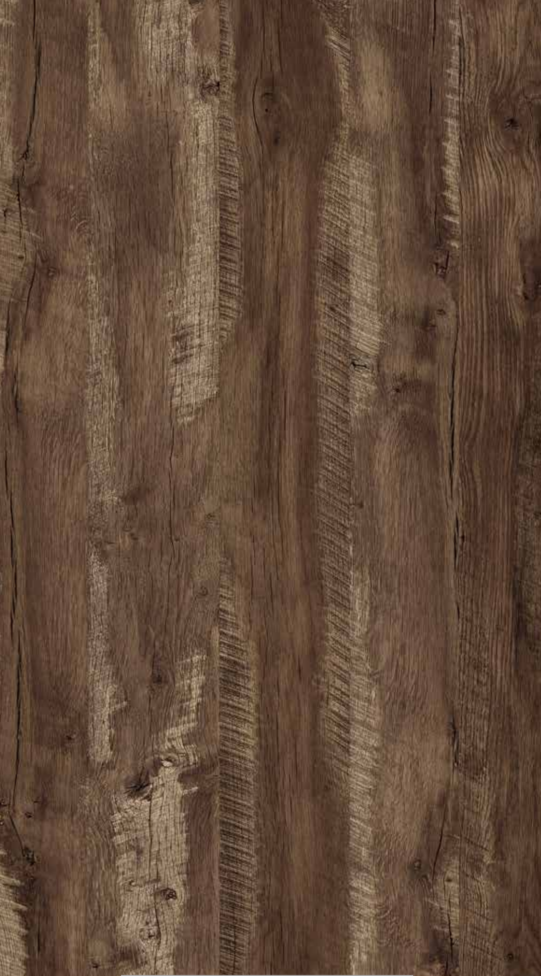
1168 CANADIAN OAK