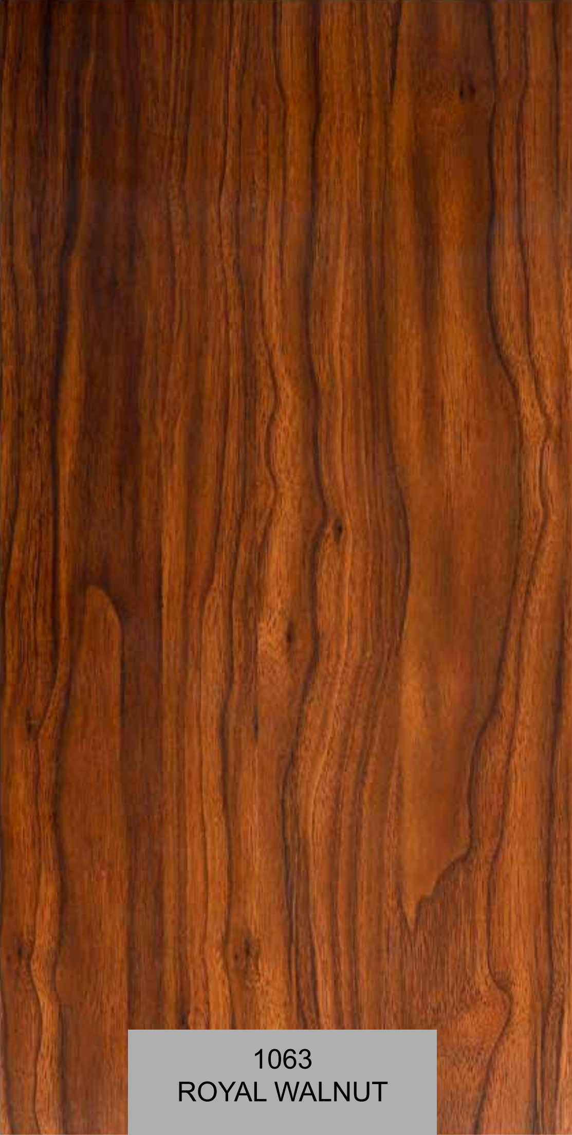
1063 ROYAL WALNUT