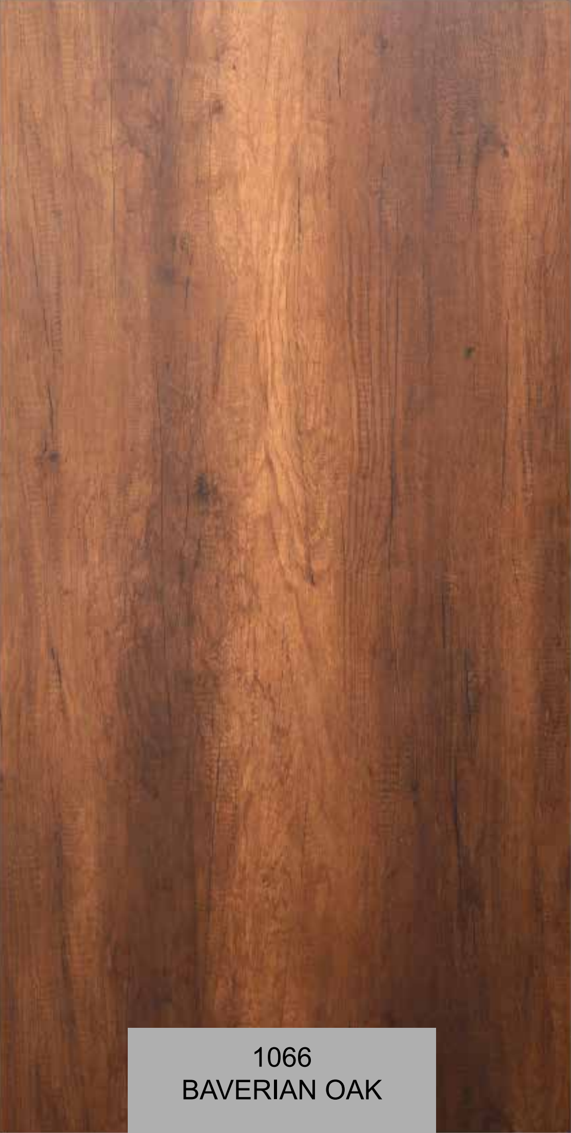
1066 BAVERIAN OAK