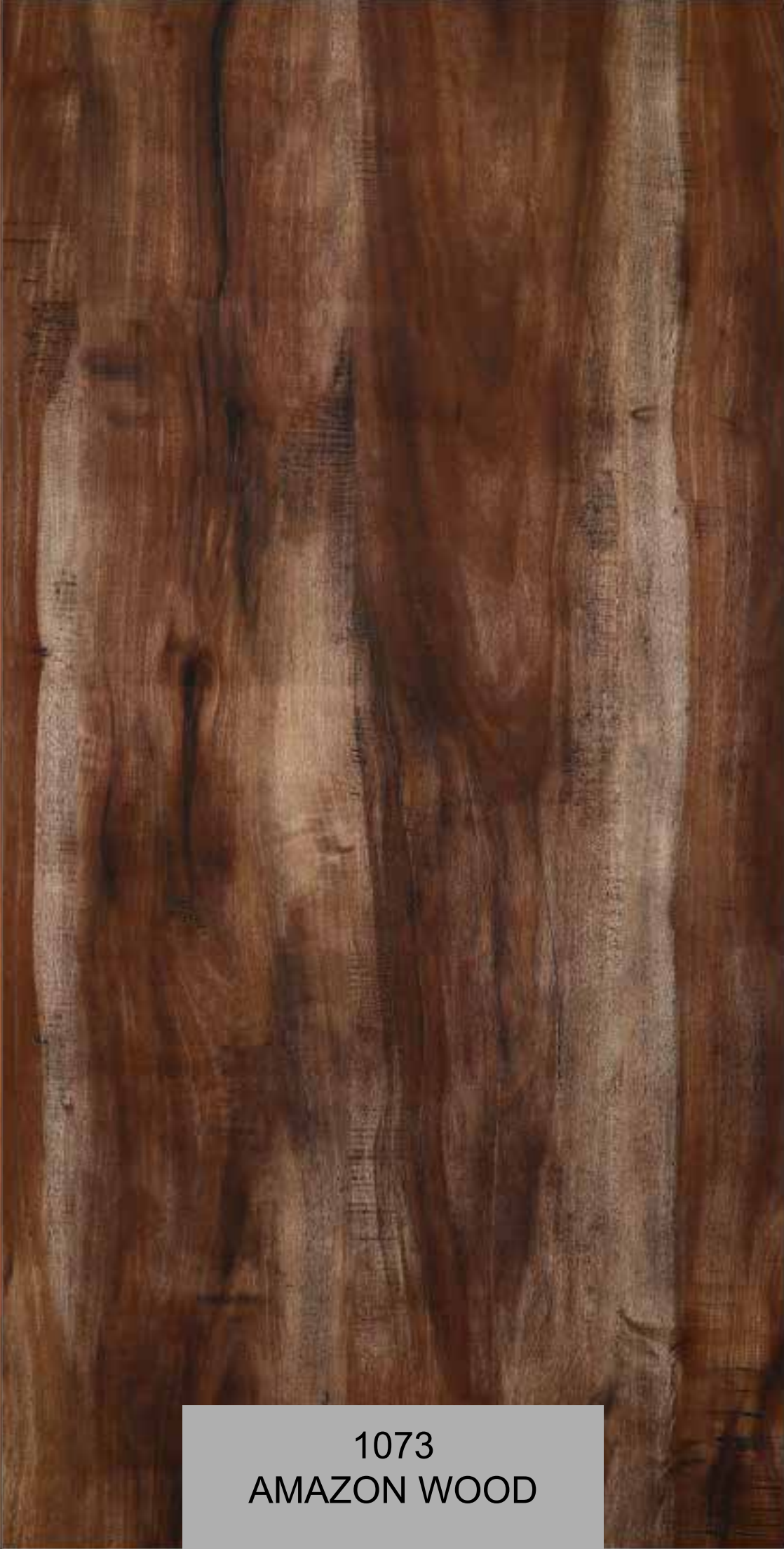
1073 AMAZON WOOD