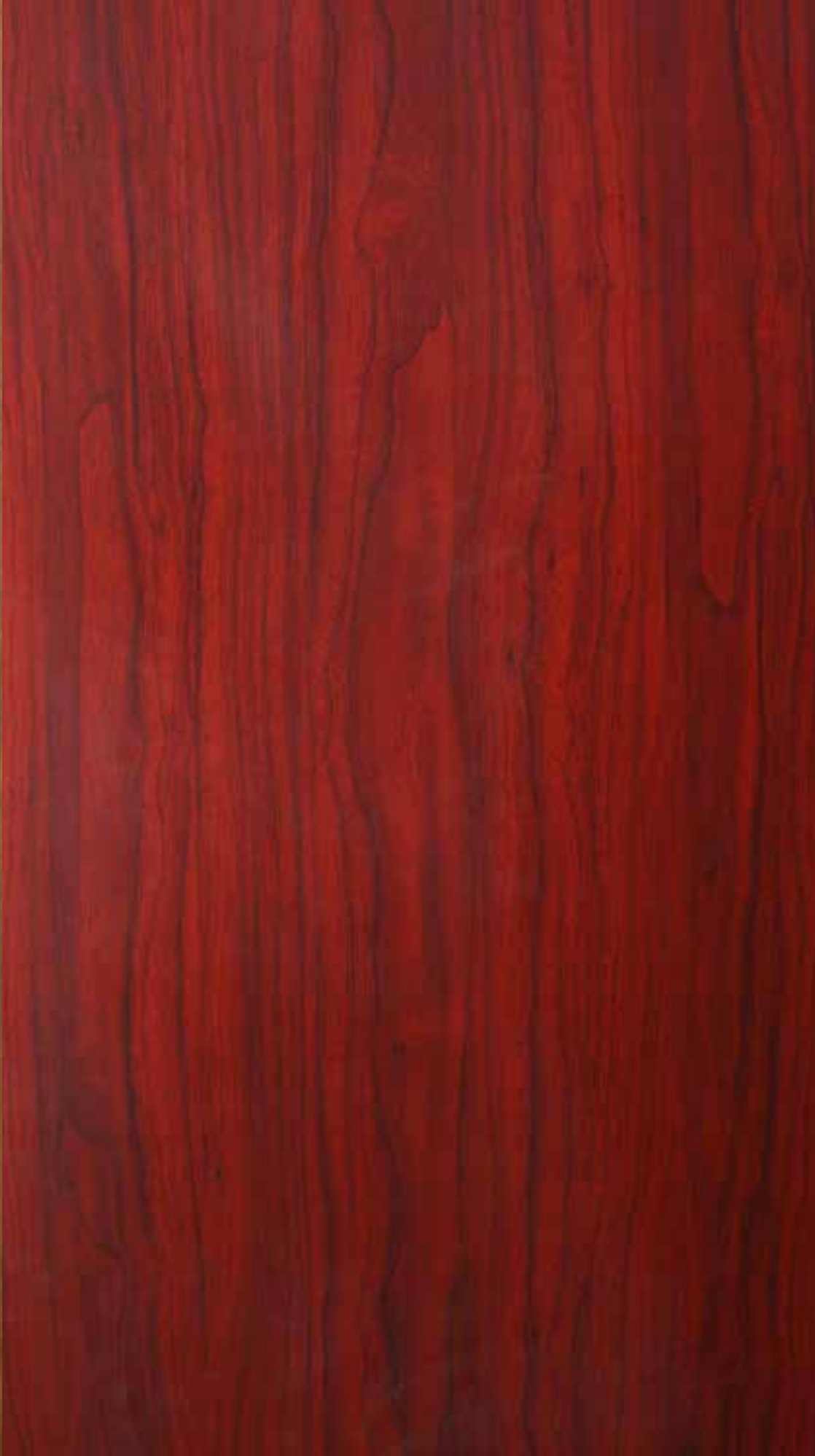
1062 ROYAL ROSE