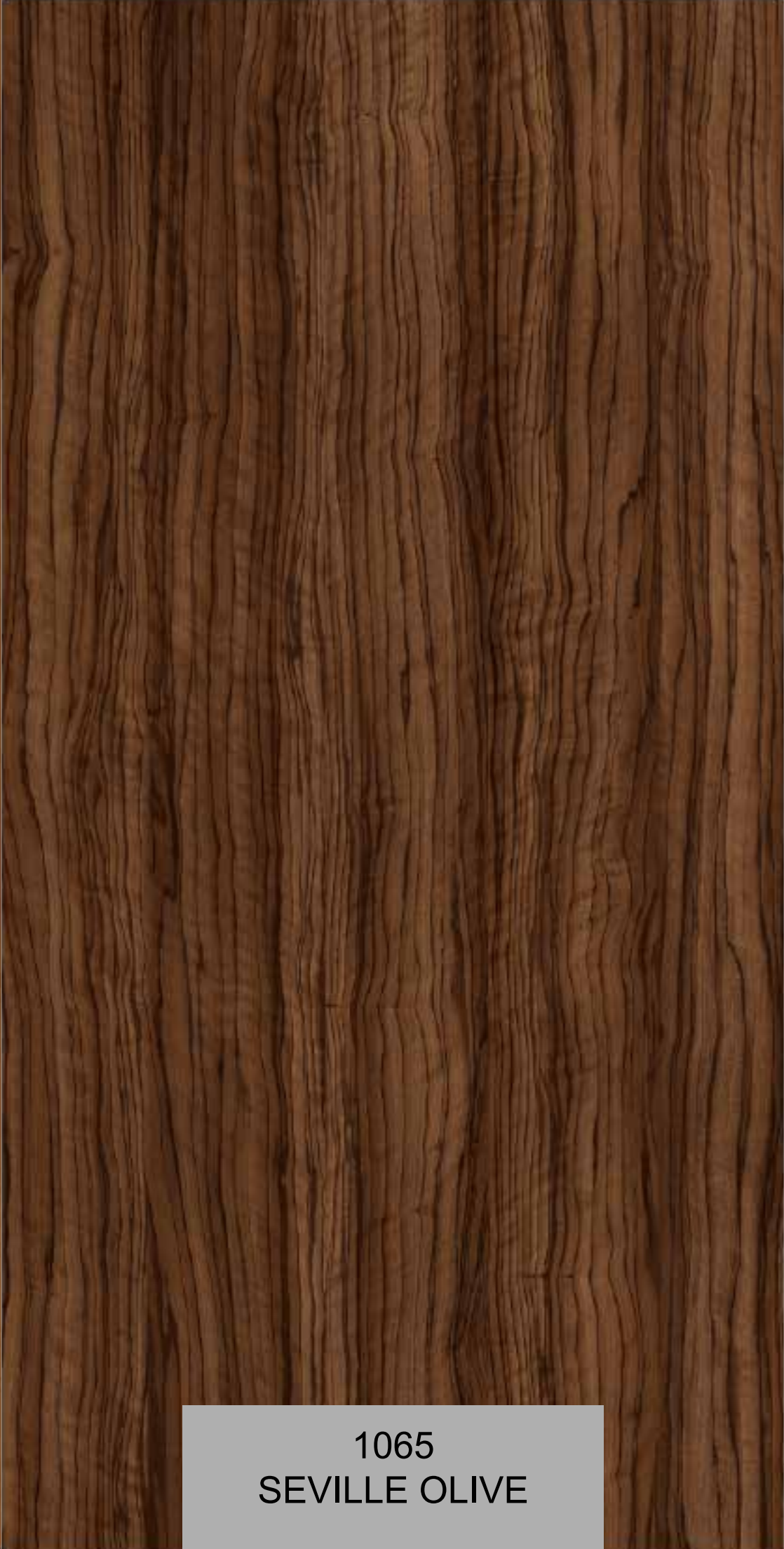
1065 SEVILLE OLIVE