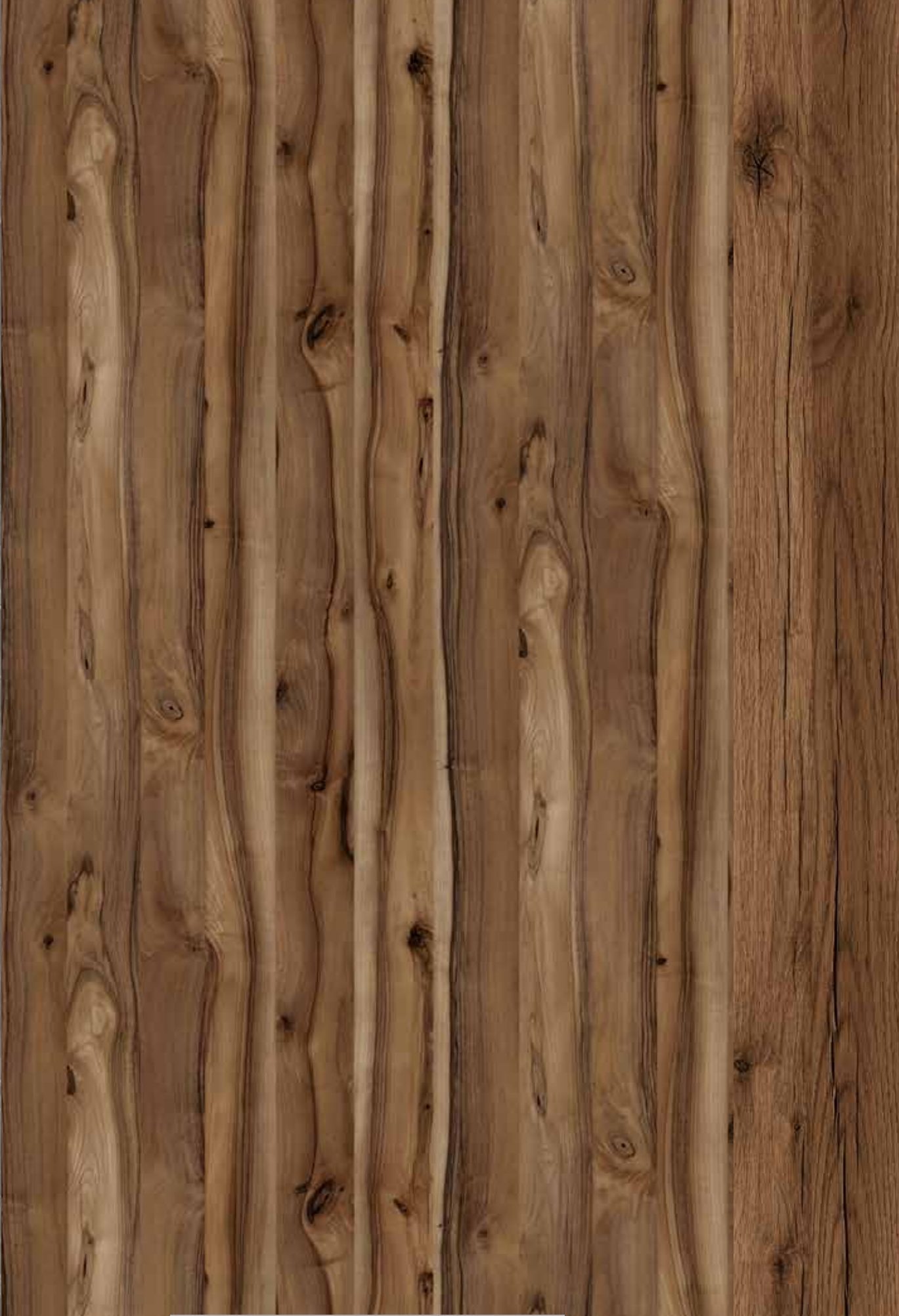
1166 TURKEY WALNUT