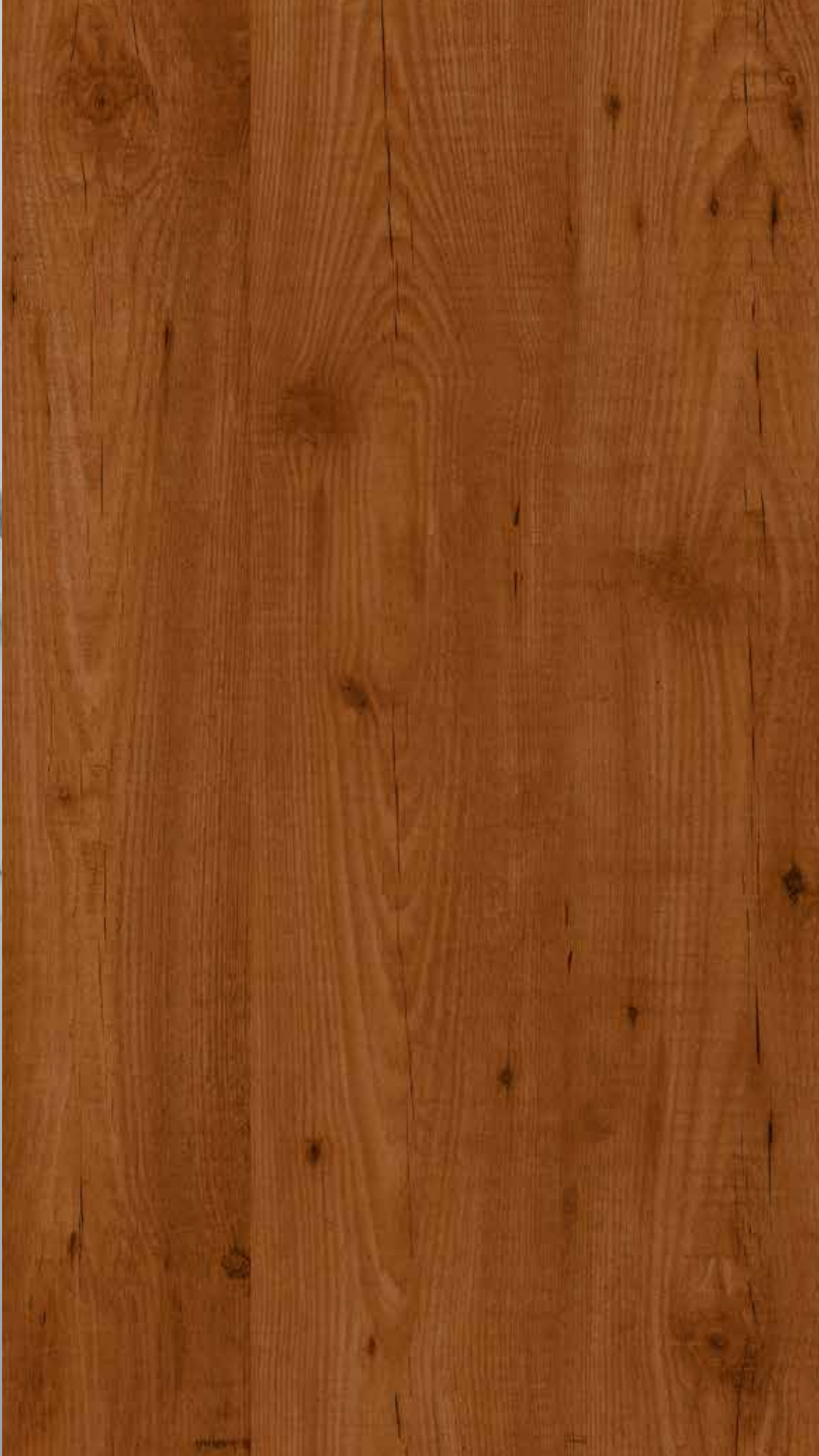
DE1037 RUSTIC WOOD