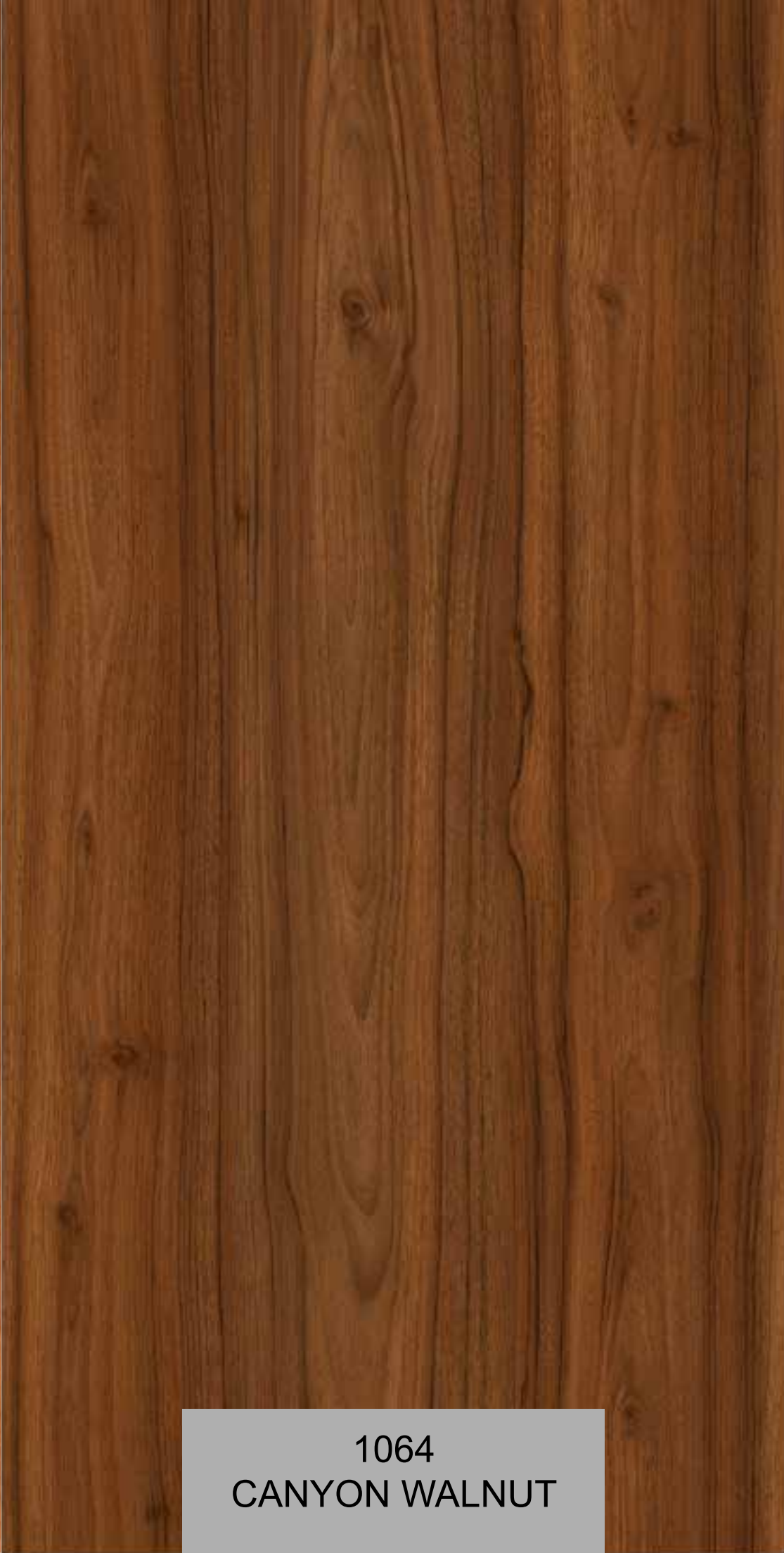
1064 CANYON WALNUT