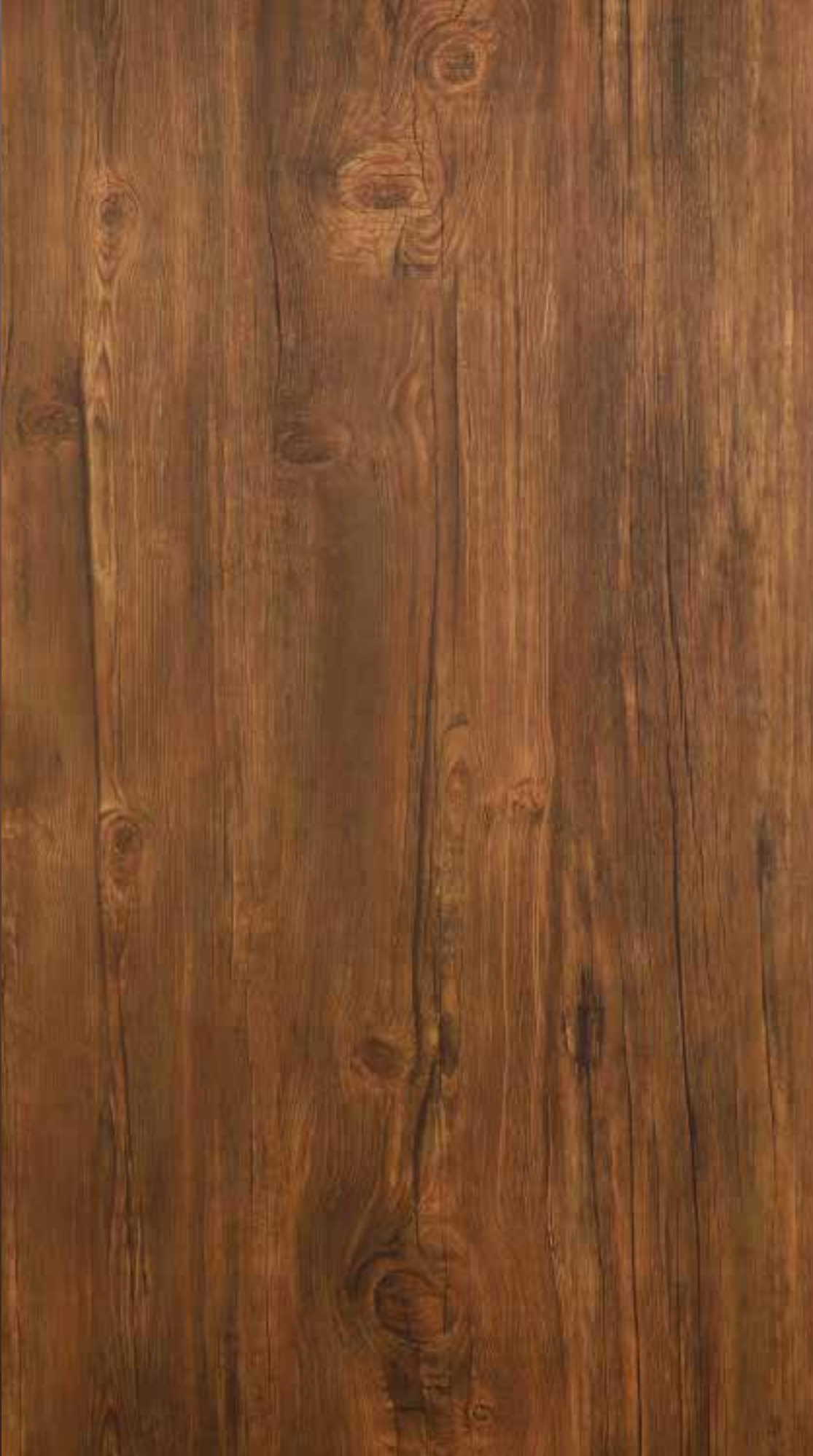
1051 TROPICAL PINE