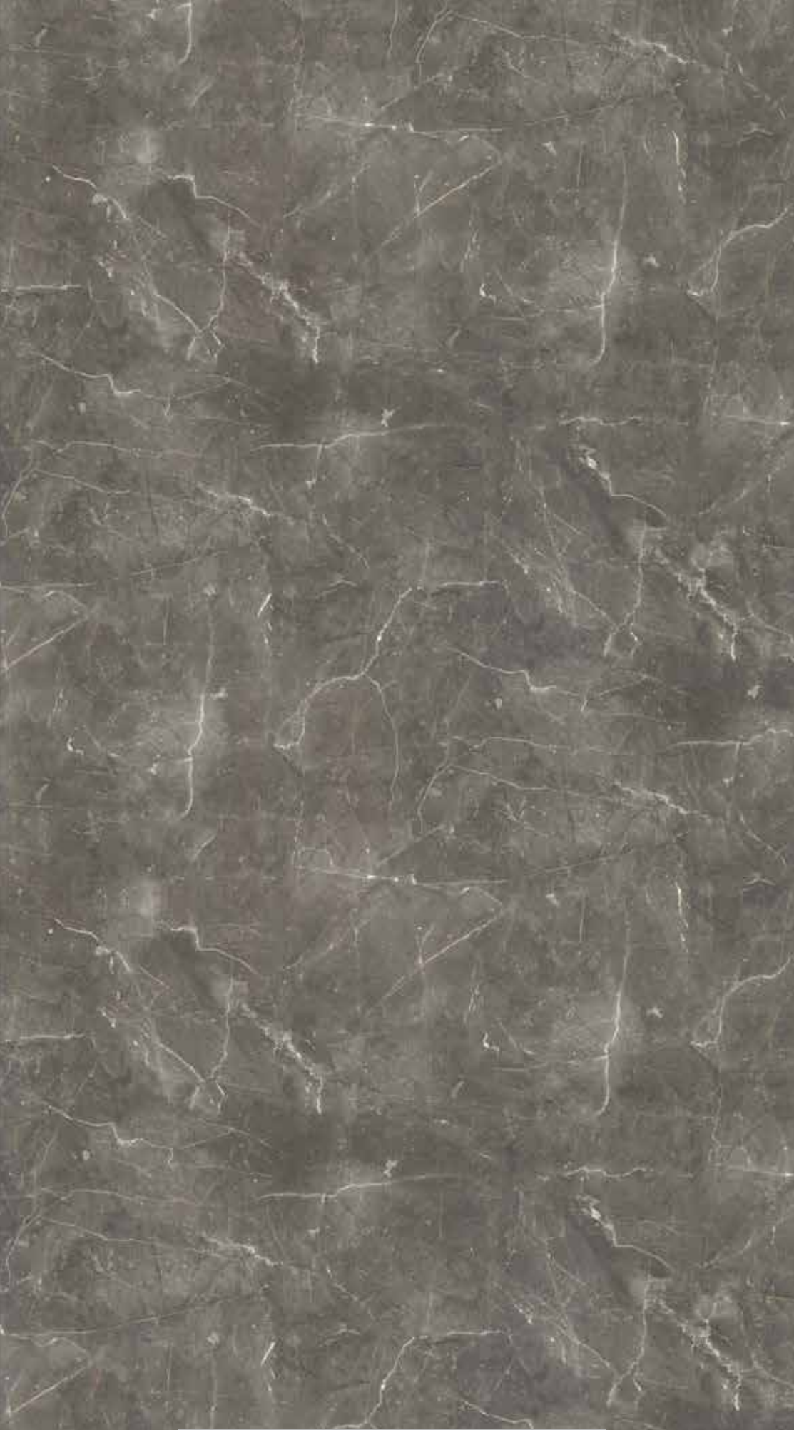
1140 IMPERIAL GREY