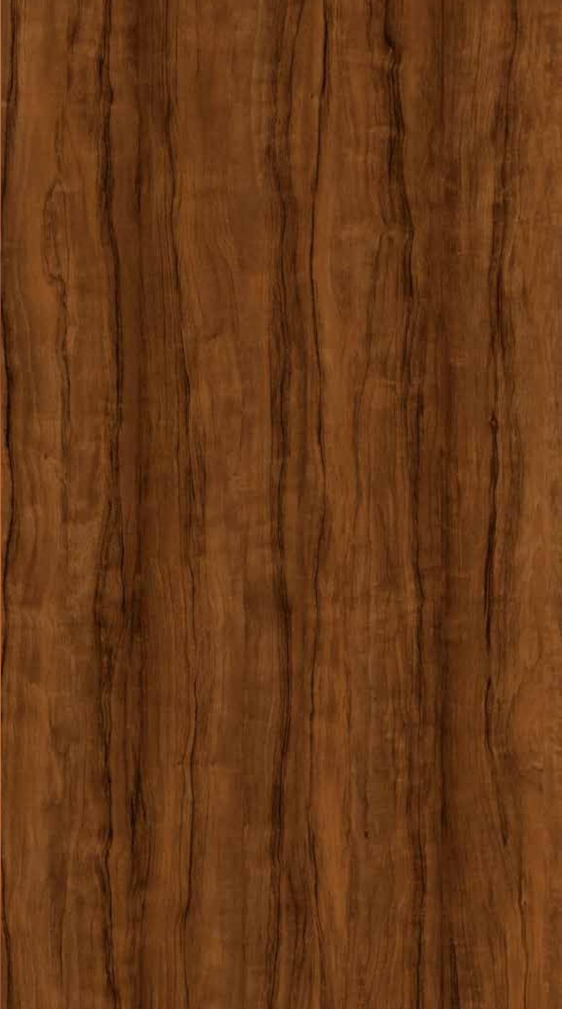
1087 SANDAL WOOD