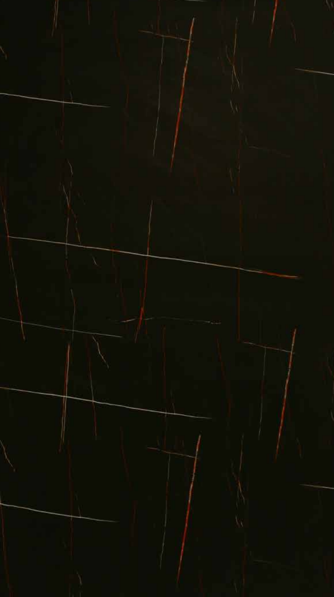
1171 NERO ST LAURENT