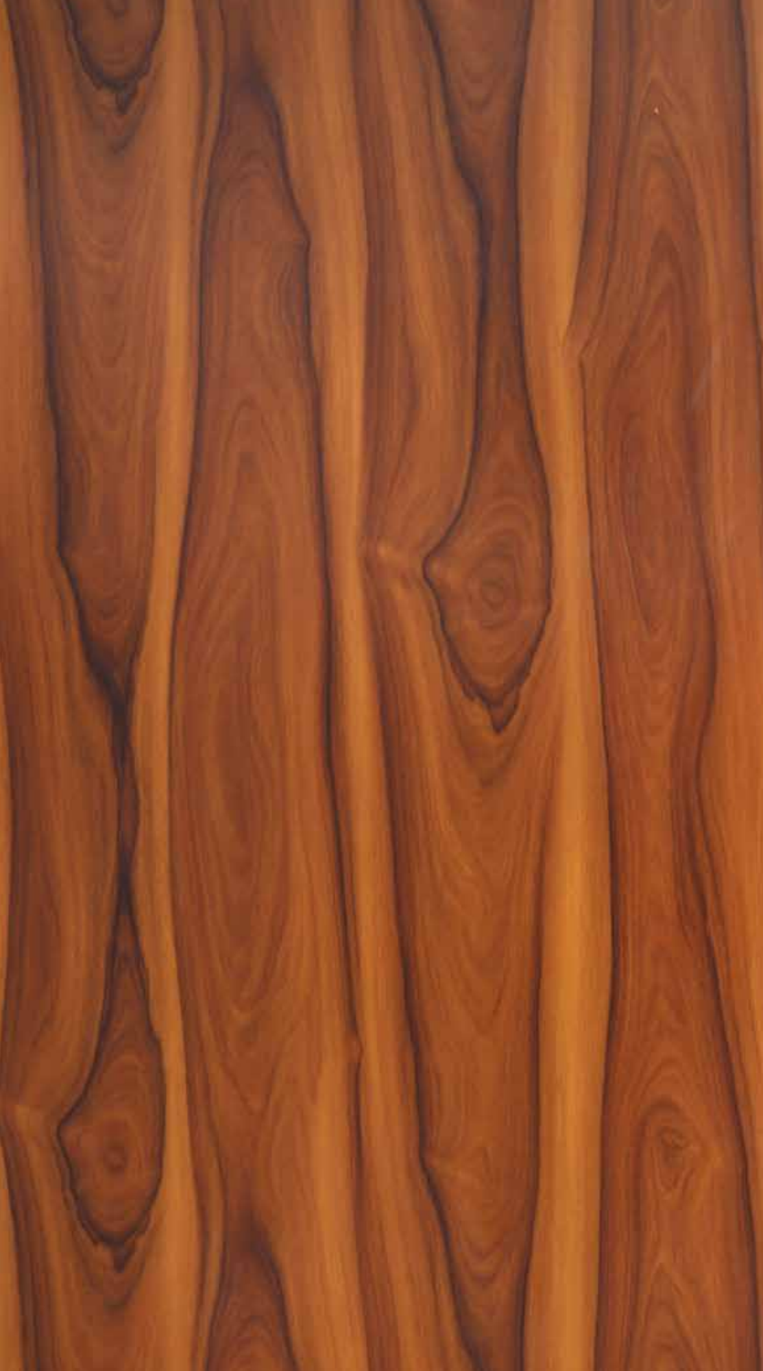
1074 IMPERIAL ZIRCOTE