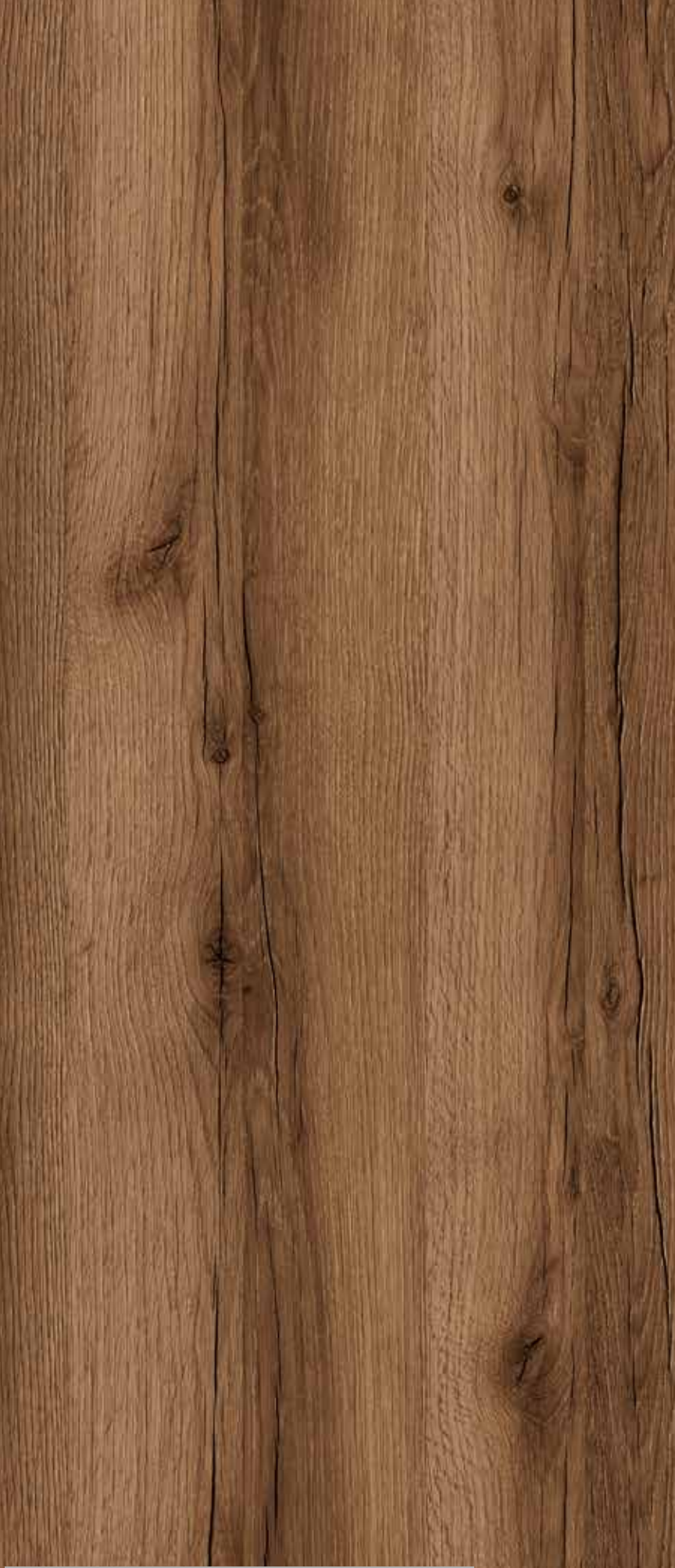
1167 MILANO OAK